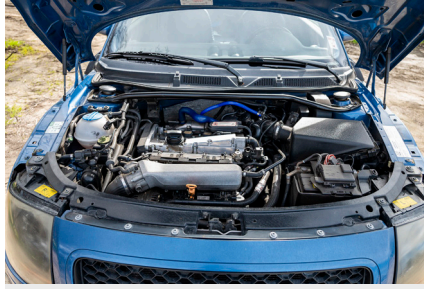
Straight Shot of Engine