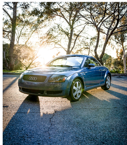
Vertical / Portrait Shots (these pictures will be used as hero shots in the website)