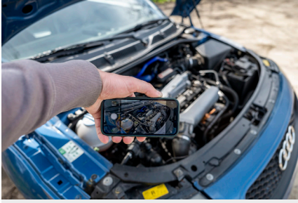
Side Shot of Engine