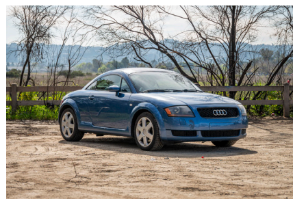
Horizontal / Landscape Shots